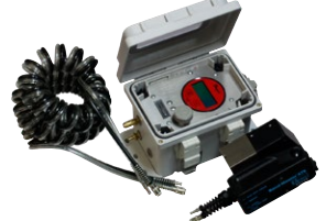
Special high-volume pneumatic tool for bench use, available for all sizes