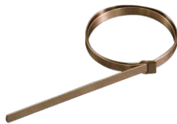
Bands are available precoiled for high-volume assembly operations