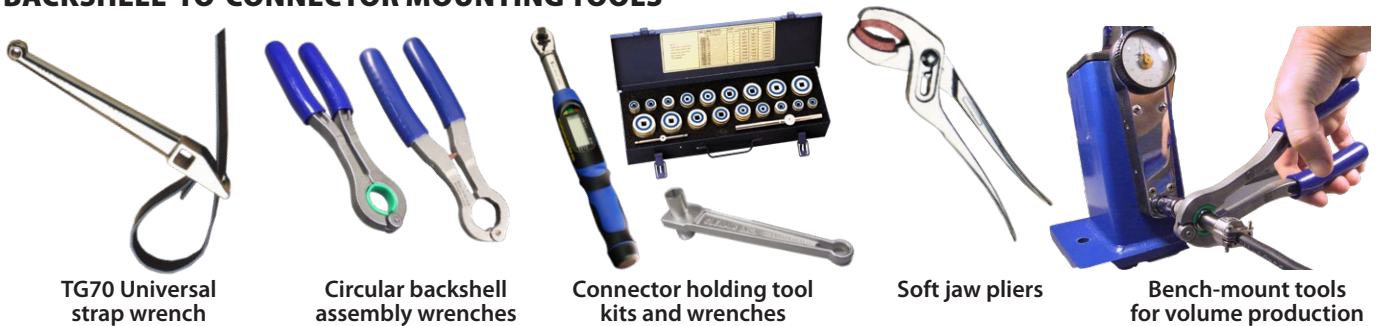
TG70 Universal strap wrench