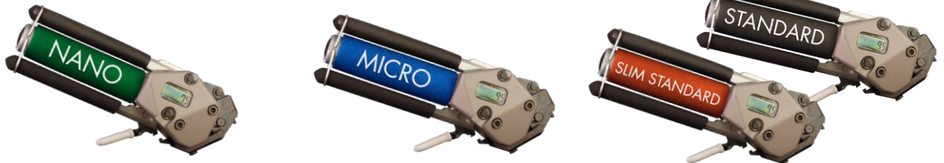
Nano banding tool for use with ultraminature connectors and banding backshells