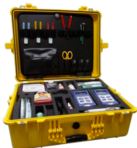
Turnkey fiber optic termination and maintenance kits