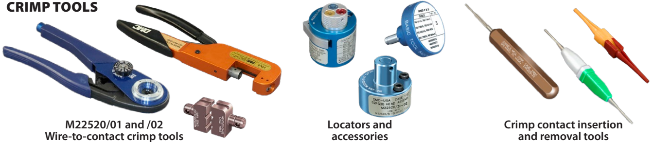
M22520/01 and /02 Wire-to-contact crimp tools