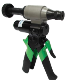
Hydraulic Earth Bond setting tools for aluminum and stainless steel plate