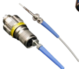
Inspection and test probes and adapters