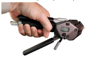
The only banding tool with a built-in calibration counter