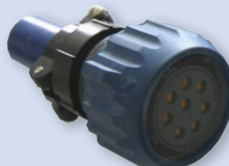
ITS-RG (Fiber Optic Blue)