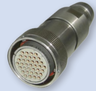
Series ITK High-Temperature Ceramic Insert