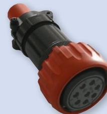
ITS-RG (Safety Red)