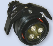
Series ITS Bayonet with Wing Locks