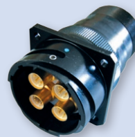
Octobyte™ Quadrax Contact Ethernet