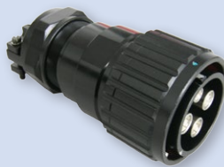
Series 901 Multi-Pin High Voltage