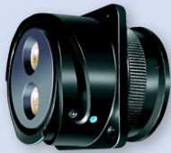
Series ITS Reverse-Bayonet