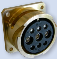
Seacrow Marine Bronze