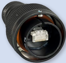
SuperSeal™ with RJ45 Ethernet