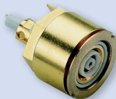
Series CX High-Speed Coaxial