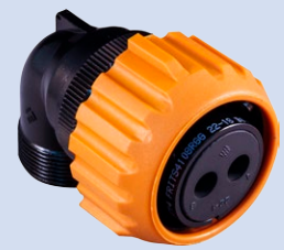
ITS-RG (Safety Orange)