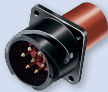
Series ITH Rigid Insert