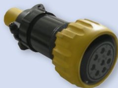
ITS-RG (Semper Tan)