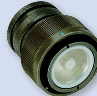
Series IGE Single-Pole Low Voltage