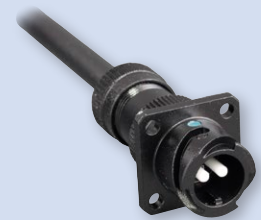
Series IFO High-Speed Fiber Optic