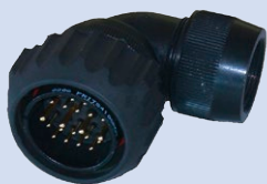
ITS-RG (Basic Black)