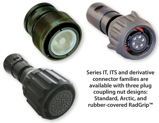
Series IT, ITS and derivative connector families are available with three plug coupling nut designs: Standard, Arctic, and rubber-covered RadGrip™