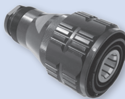
Series 500 Single-Pole High Voltage