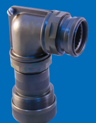
M28840/25 90° EMI/RFI Conduit Adapter