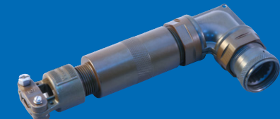
M28840/8 90° EMI/RFI Environmental Backshell