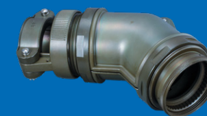
M28840/9 45° EMI/RFI Environmental Backshell