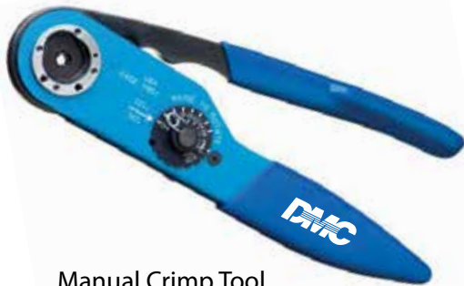
Manual Crimp Tool AF8

Daniels (DMC) tools have been utilized in military aircraft and aerospace programs for over 60 years. Surely the leading company in crimping technology, it's used by Glenair as first choice for these powerful tools. Hereafter you find a cross table of P/Ns for our ruggedized power and signal connectors series ITS and the other MIL-DTL-5015 type products.