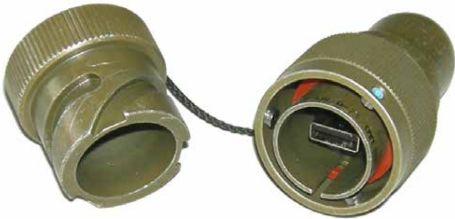
Figure 1 ITS with USB-A Memory Key