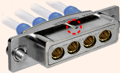
Plug connector with key at position B