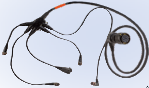
Antenna for Intercom, Public Address, Next Station Announcements, and Data Transmission to Control Center