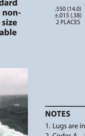
Glenair MIL-DTL-24749 Rev. C Type IV Stainless Steel/Nickel Ground Straps: US Navy qualified and tested to survive extreme environments