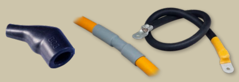
Mil-Aero / Industrial fluidresistant lipped shrink boots

Pesigned for rugged weathering, UV and ozone-resistant performance, Glenair Autoshrink is the one-piece easy-action shrink boot and tubing solution. Quickly attach shrink boots, splice insulation, or repair Glenair Duralectric formula jacketing. Straight, 45° and 90° angle lipped shrink boots lock into boot groove on adapters to keep out environmental debris. Universal design Autoshrink tubing delivers reliable and durable sealing as well as mechanical protection for cable-end terminations in harsh military and industrial applications. Built from Glenair Duralectric formula material, Autoshrink is fully hydrophobic and resistant to caustic chemicals and solvents. Easy-action spiral hold-out and large cold shrink ratio makes for fast installation and durable, split-resistant performance.