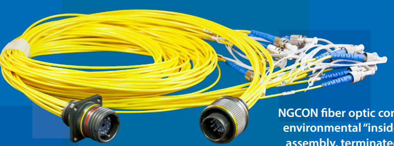
NGCON fiber optic connectors in a non-environmental "inside-the-box" cable assembly, terminated to commercial fiber optic connectors

The Glenair Next Generation MIL-PRF-64266 (NGCON) fiber optic connection system is a high-performance solution for air, sea, and space applications. Developed with the NGCON design consortium, the system combines proven technology from standard MIL-PRF-28876 and MIL-DTL-38999 Series III designs with new innovations including rear-release genderless contacts, high-density packaging, and removable alignment sleeve retainers (ASR).